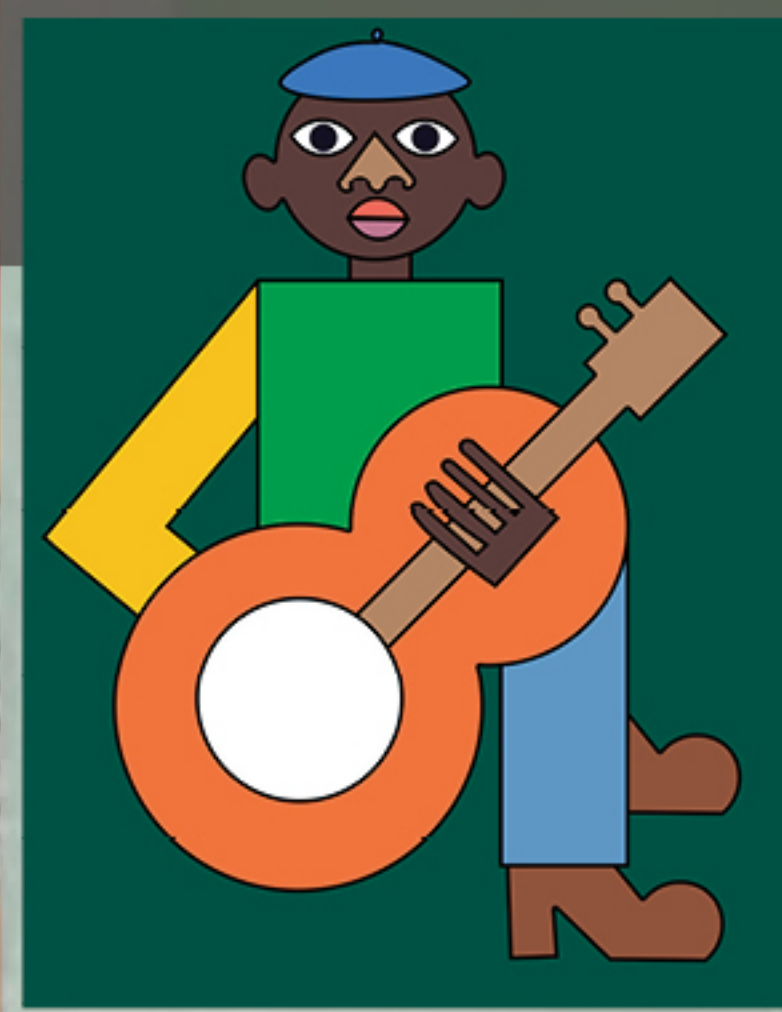
"Guitar Man" Digital render