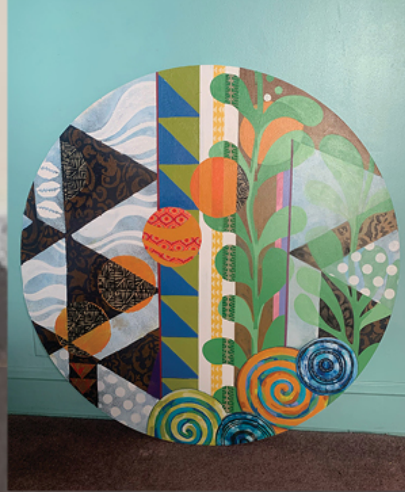
"Feminism, Fertility and the 1970's" 2023 Latex on Wood - 4 feet