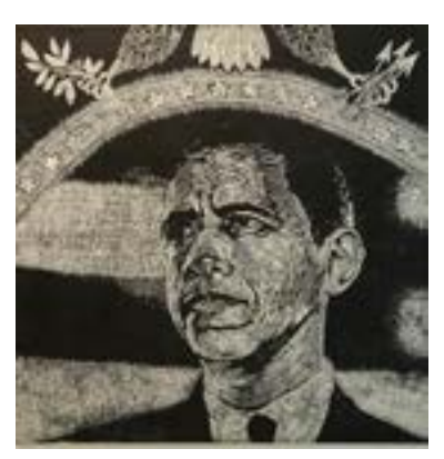
Mesilla Smith Peace and War Oil relief print on canvas 40" x 40" $1,300