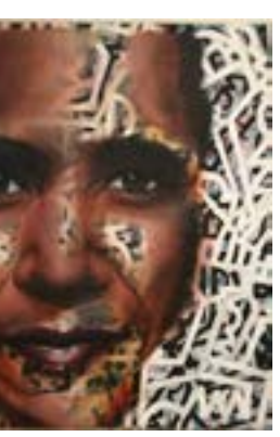
Acrylic, ink, and airbrush