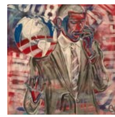
J.A. Medcalf Forever 44 Acrylic and spray paint 40" x 40" $1,200