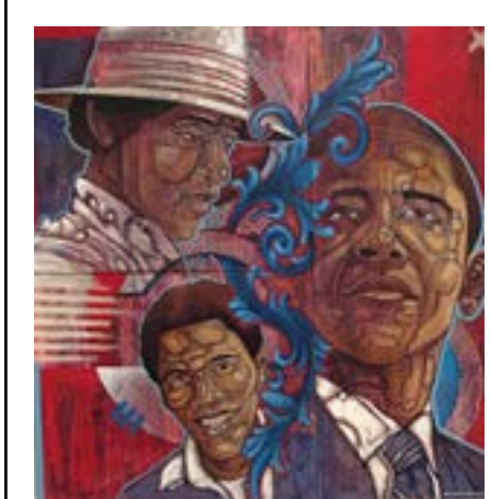
David Anthony Geary American Journey Acrylic on canvas 40" x 40" (triptych) $5,000