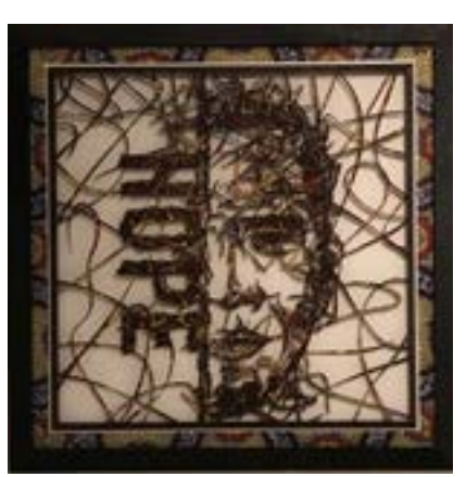
Maxwell Emcays Together Wood, fabric & mixed media 40" x 40" $2,000