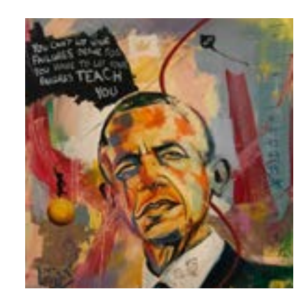
Paul Branton 44 Mixed media on canvas 40" x 40" $2,016