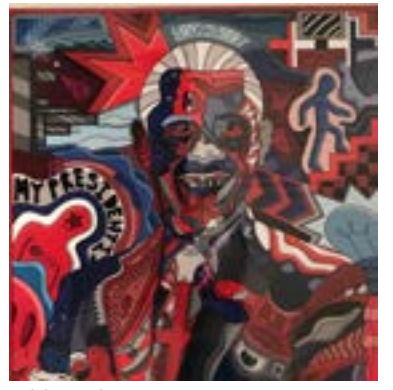
Eddie White Forevermore Illustration on foam core 42" x 42" $2,200