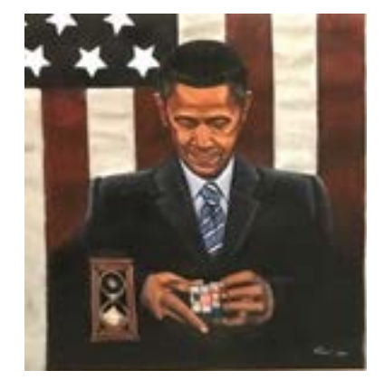
Robert Carr The Last Hour Oil on canvas 24" x 36" $2,000

Roger Carter Power Spray paint, pa canvas 40" x 40" $1,200