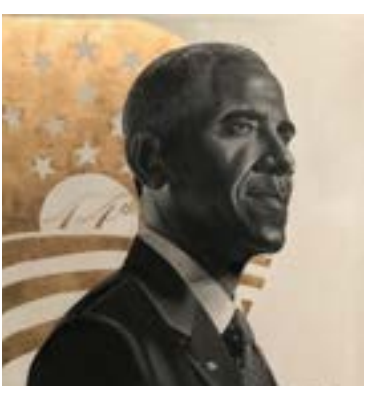
James Nelson The 44th President of the U.S.A Acrylic and gold leaf on canvas 40" x 40" $3,200