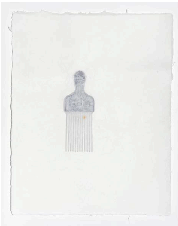
Krista Franklin, Black Power 1 , 2012

Media Contacts: cpjmorgan@gmail.com tenille@romesjoy.com